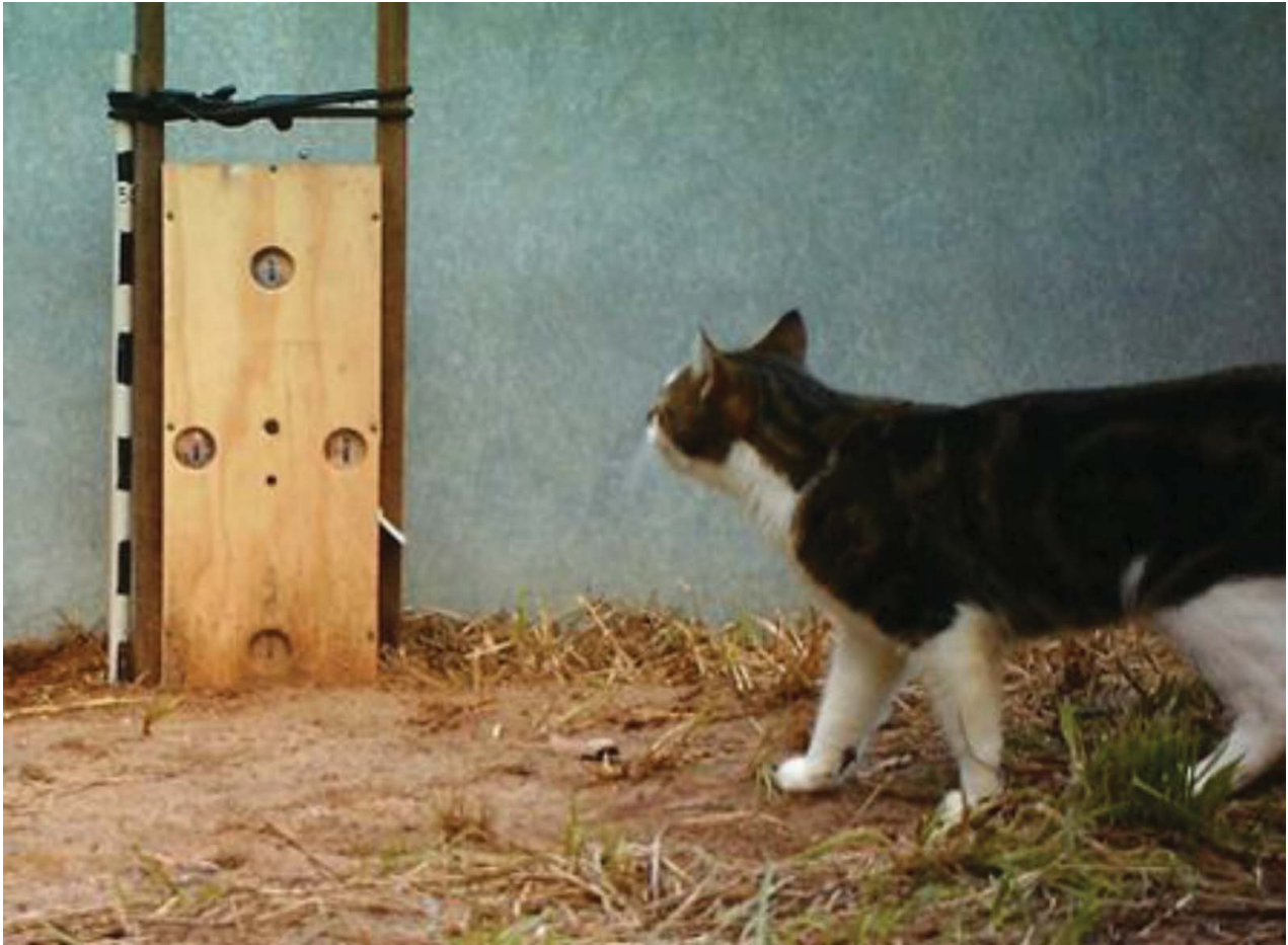
Plate 1. Feral cat approaching the “walk past” grooming trap prototype.

Institute facilities at Frankston, Victoria. Foxes and cats were acclimatised for at least 24 hours in holding pens prior to entering the test pens. All pens contained water, food and a covered shelter site and all husbandry and experimental procedures were covered by Ethics permit 10/11, issued by the Victorian Department of Primary Industries Wildlife and Small Institutions Animal Ethics Committee.