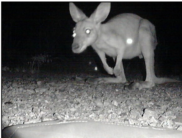
Figure 2. A euro that was correctly identified as a non-target, despite triggering the correct sensor arrangement.