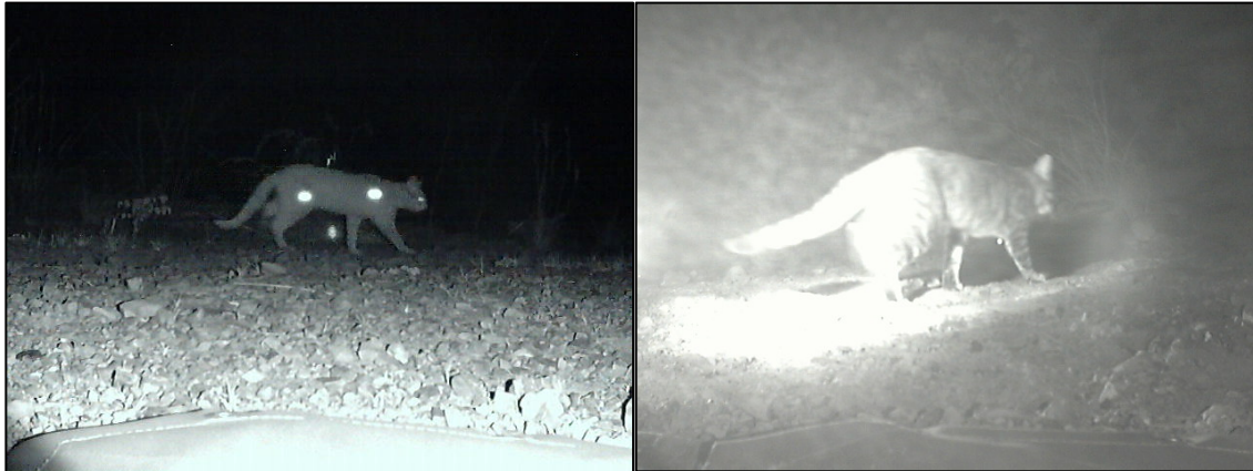
Figure 1. Feral cats correctly identified as targets during the Pilbara Felixer trials.

These automated units provide a promising method for targeted feral cat control at specific localities. Situations where they may be particularly appropriate include: high-value threatened species populations in restricted areas, predator “sink” locations (such as on the outside of predator exclosures) or “source” locations (such as minesite rubbish tips), in locations where movement of feral cats is restricted (such as peninsulas or islands), or where a large number of non-target species prevent use of other techniques. The units have low maintenance requirements, which is advantageous in remote regions.