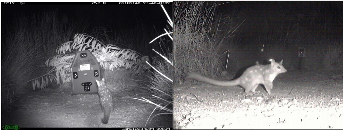
Figure 3. Northern quolls visiting the Felixers. Northern quolls crossed only the bottom sensor 99% of the time.